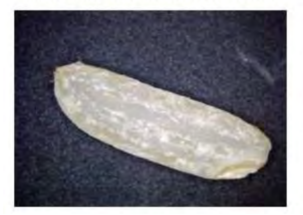
Milled White Rice after going through a Water Polisher