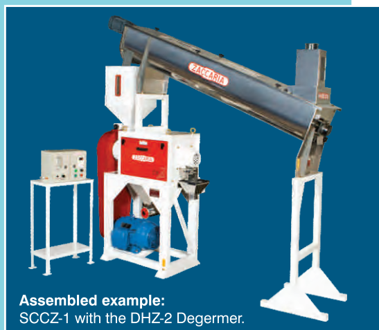
Assembled example: SCCZ-1 with the DHZ-2 Degermer.

- The machine is originally supplied without motor.