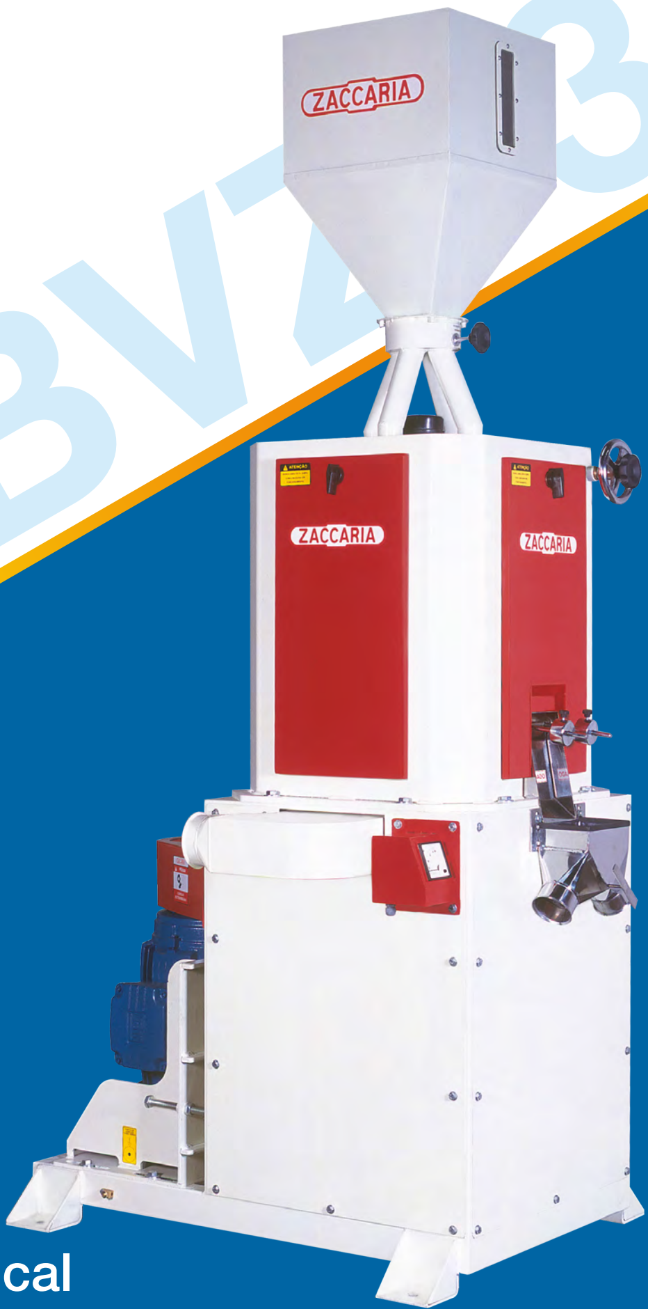
Vertical Whitening Machine BVZ-3