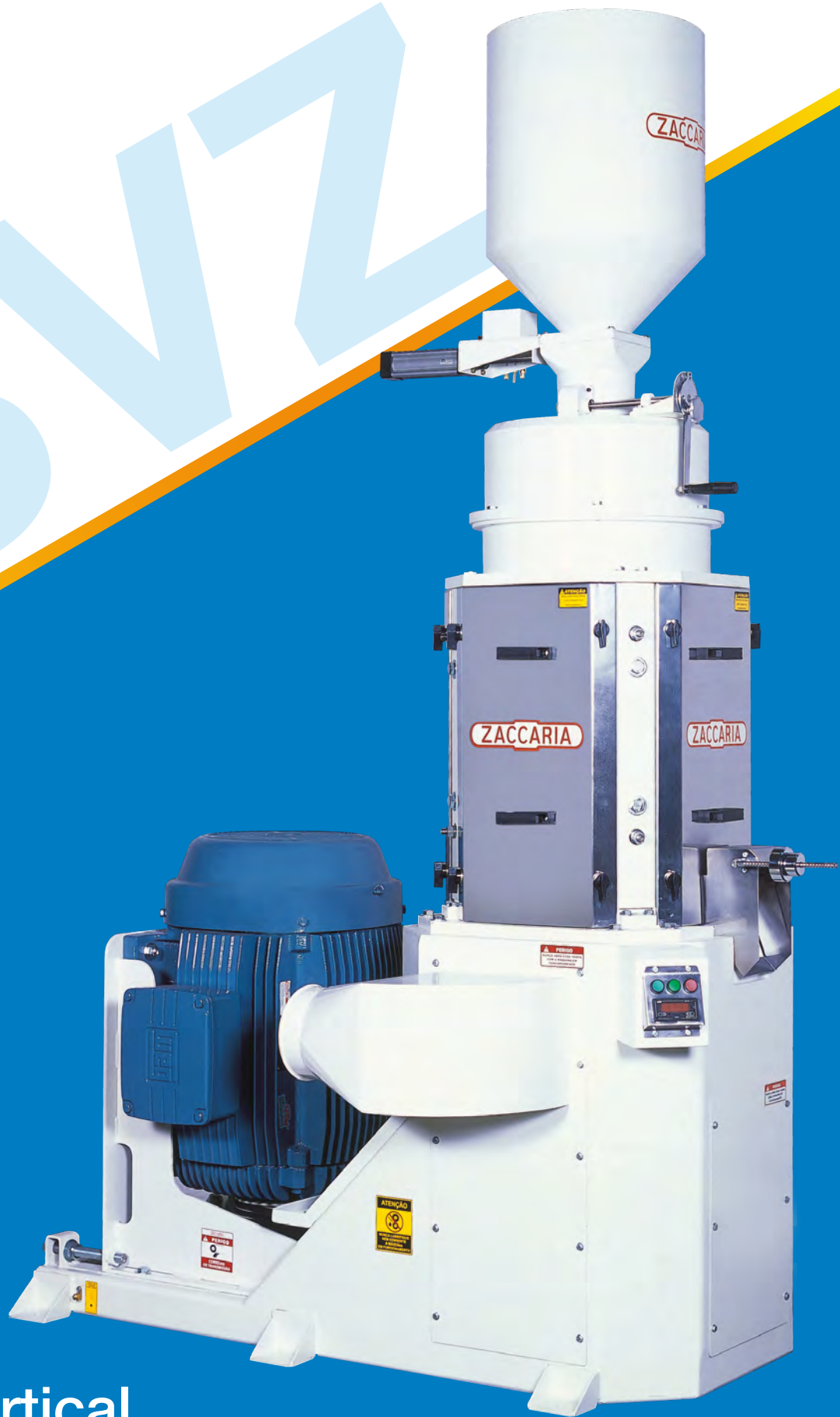
Rice Vertical Whitening Machine BVZ-1