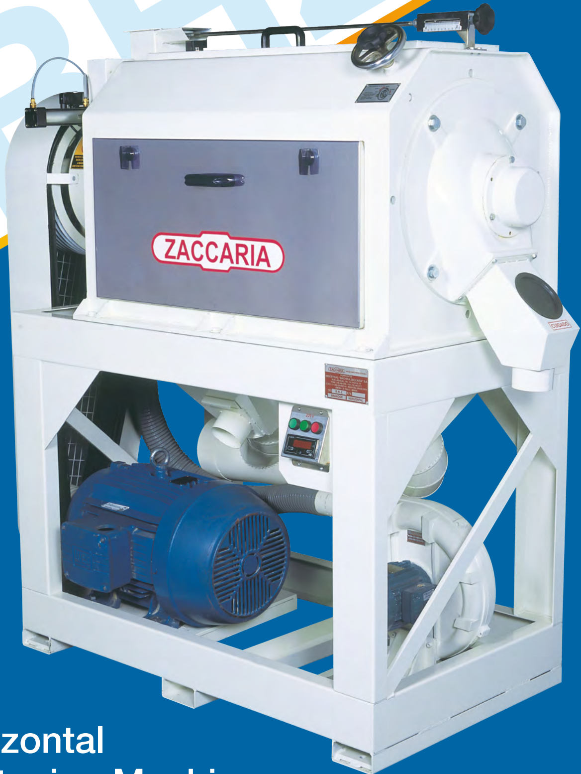
Horizontal Whitening Machine BHZ